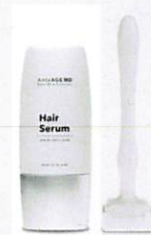
HOME HAIR SYSTEM